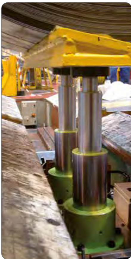
Double Acting Telescopic Cylinders DL.