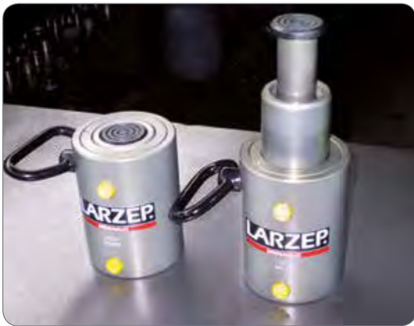
Special Double Acting Aluminium Cylinders DLA.